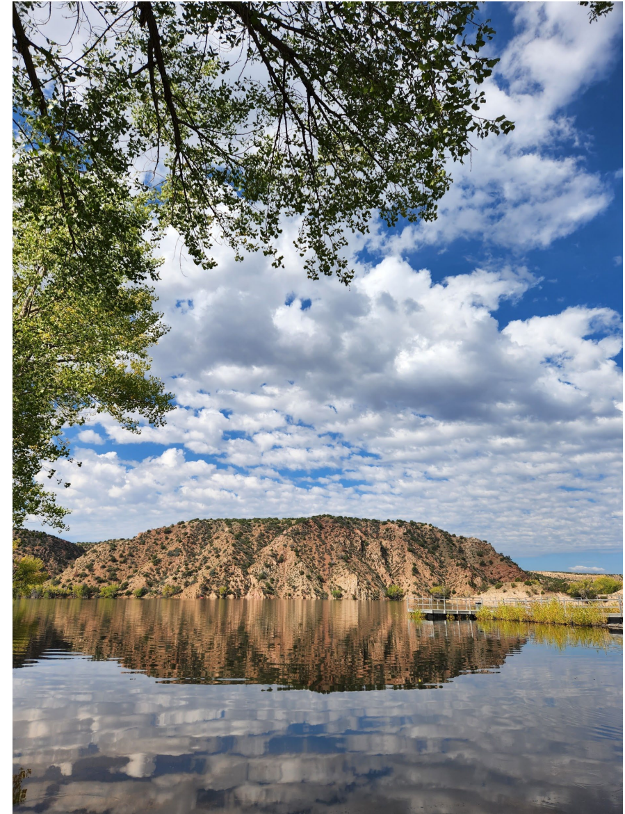
A cloudy morning looking over Santa Cruz Lake

With gratitude we pay our respects to the land, the people and the communities that contribute to what today is known as the State of New Mexico.