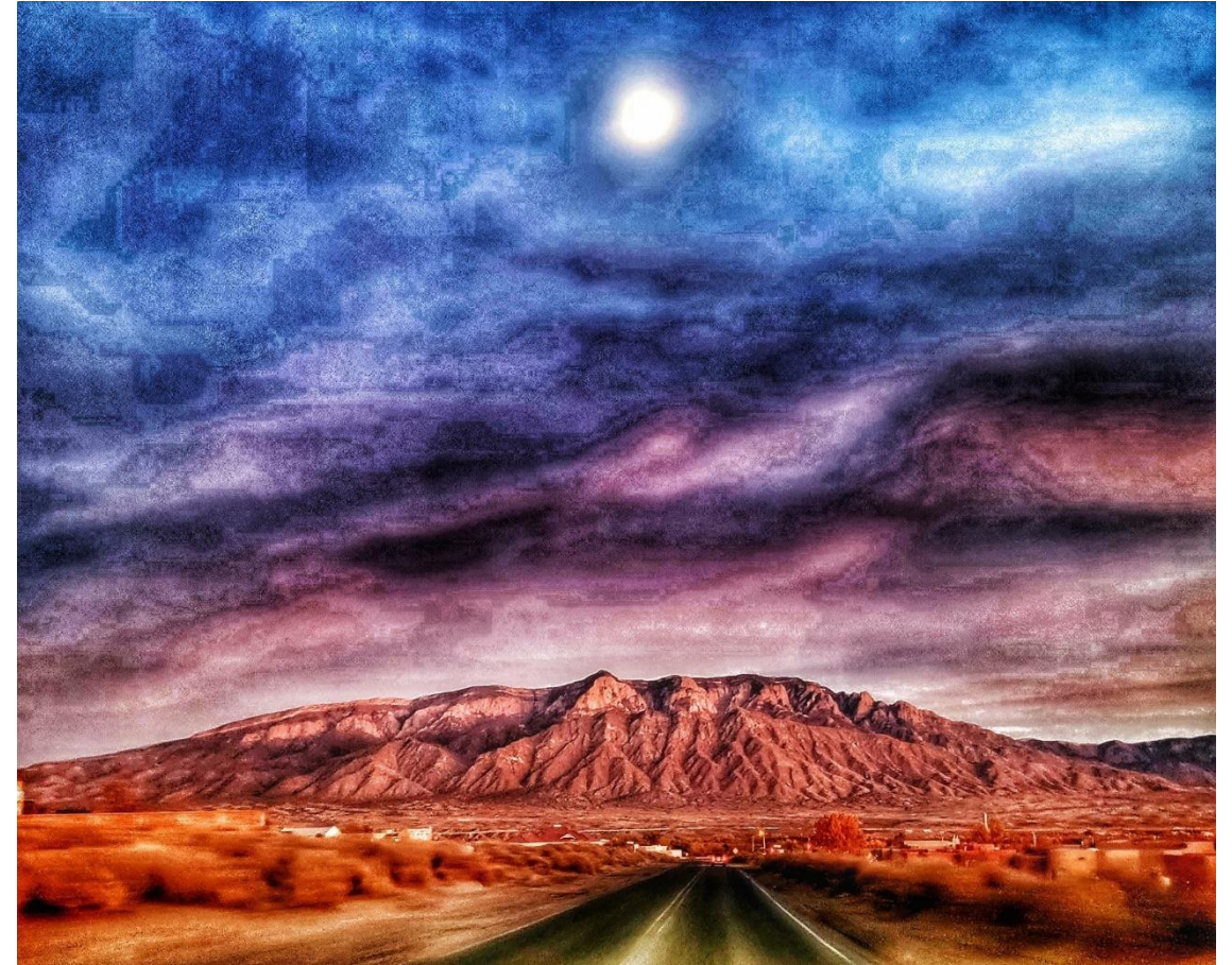
Evening drive through Corrales, NM in October 2021.

With gratitude we pay our respects to the land, the people and the communities that contribute to what today is known as the State of New Mexico.